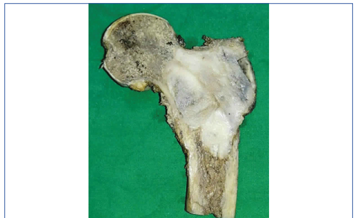
[Table/Fig-2]: Gross image of the cut section of resected upper part of right femur showing the circumscribed expansile grey white tumour.

greater trochanter. The cortex and periosteum overlying the tumour appeared thinned out [Table/Fig-2].