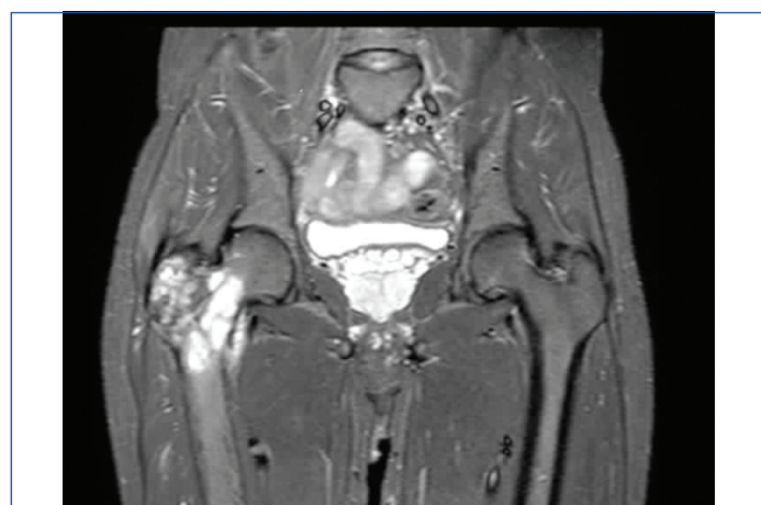
[Table/Fig-1]: MRI image showing a well-defined expansile lobulated intramedullary tumour in the upper part of right femur.

On Magnetic Resonance Imaging (MRI), a well-defined, expansile, lobulated, intramedullary T2 weighted and STIR (short T1 inversion recovery) heterogeneously hyperintense and T1 weighted isointense lesion was noted involving the metaphysis of the neck, lesser and greater trochanter of the right femur. Thinning of the overlying cortex was seen with no break. It showed post contrast diffuse enhancement with foci of blooming [Table/Fig-1]. A possibility of locally aggressive giant cell tumour of right proximal femur was proposed.